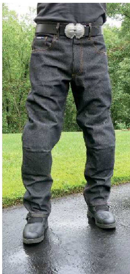
Blue Aerostich Protekt Jeans with TF3 armor pads installed.