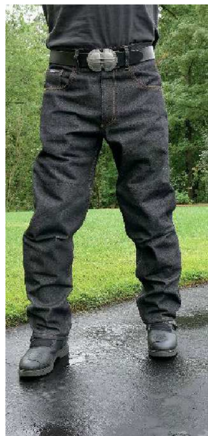
Blue Aerostich Protekt Jeans with TF3 armor pads removed.