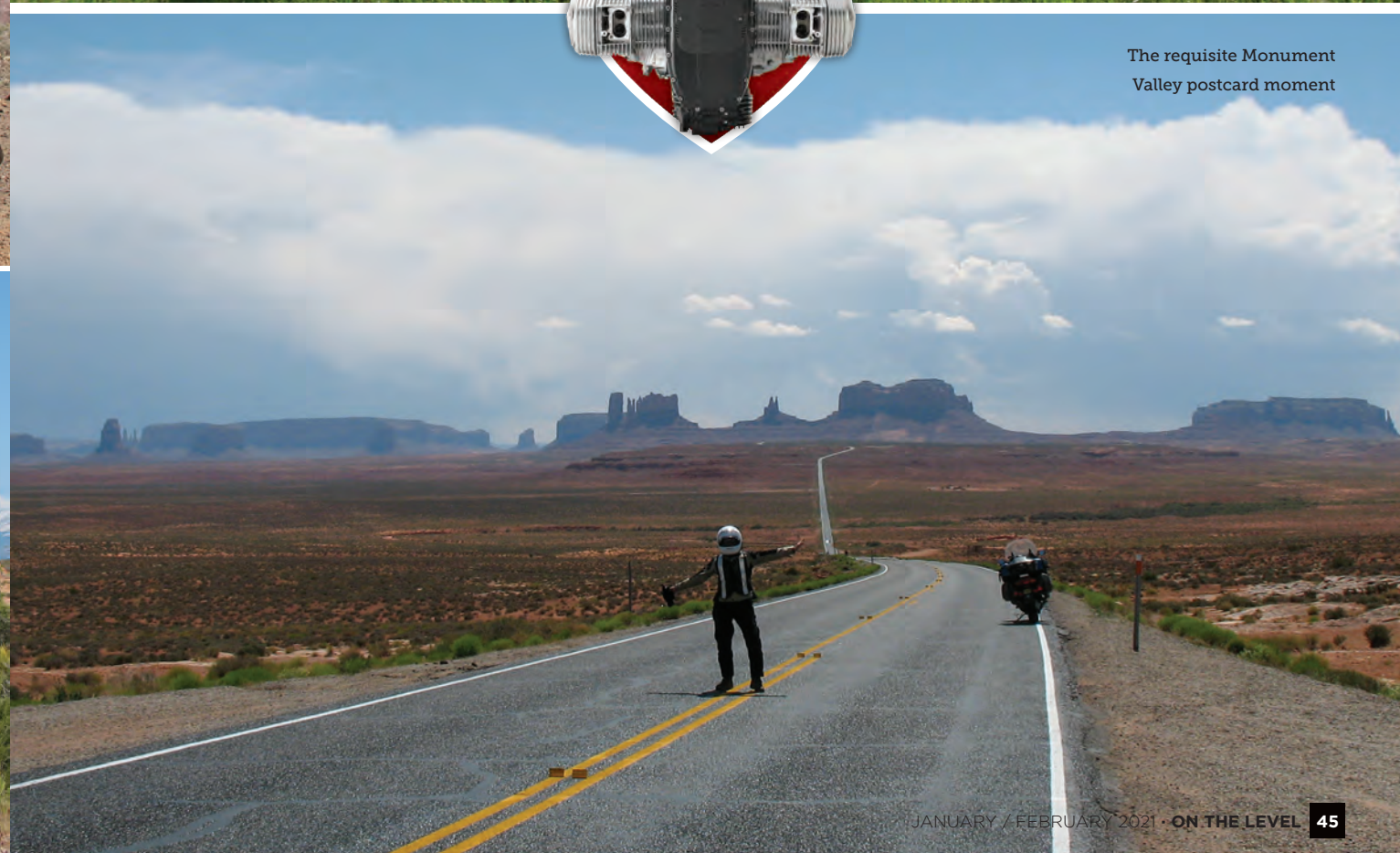
The requisite Monument Valley postcard moment