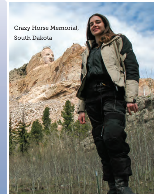
Crazy Horse Memorial, South Dakota