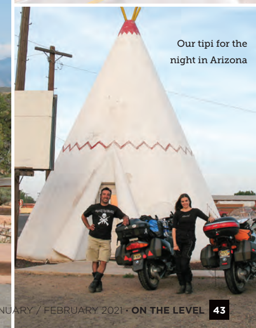
Our tipi for the night in Arizona