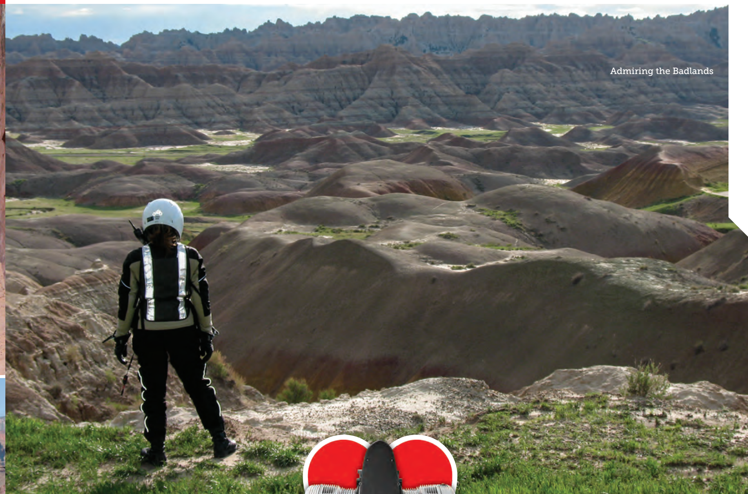
Admiring the Badlands