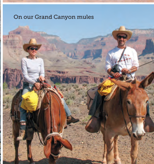
On our Grand Canyon mules