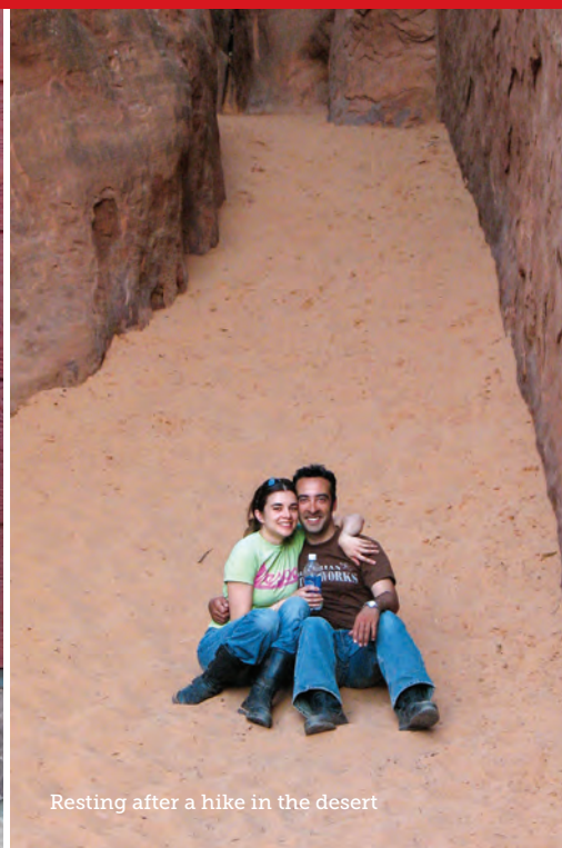
Resting after a hike in the desert