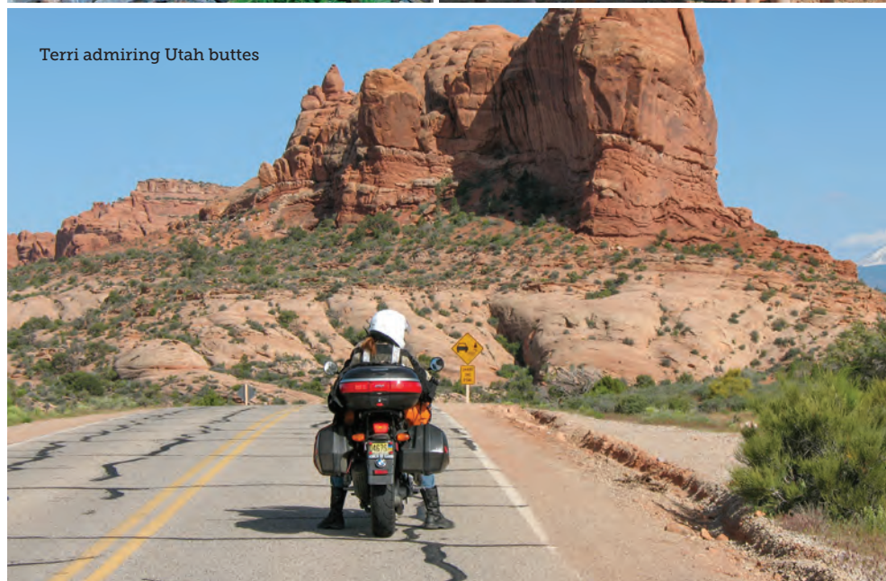
Terri admiring Utah buttes