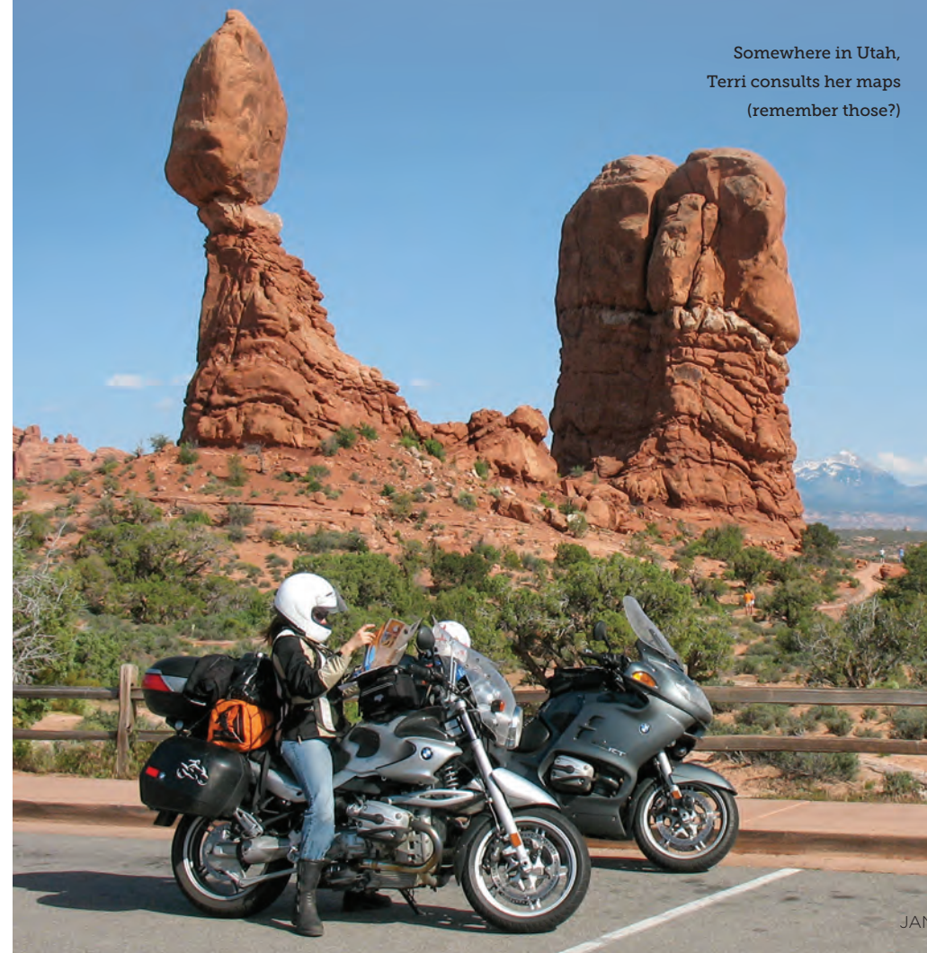
Somewhere in Utah, Terri consults her maps (remember those?)

After a few days hiking around Yellowstone, we saddled up and pointed our Oilheads north towards Montana, where Big Sky and Glacier National Park awaited. Unfortunately, steady rain, leftover snow, and the resulting landslides meant that the famed "Going To The Sun Road" was mostly closed to our motorcycles. However, even the small unpaved sections we surveyed were spectacular in scope and well worth the soggy effort it took to get there. To dry off, we headed south again to Utah to visit