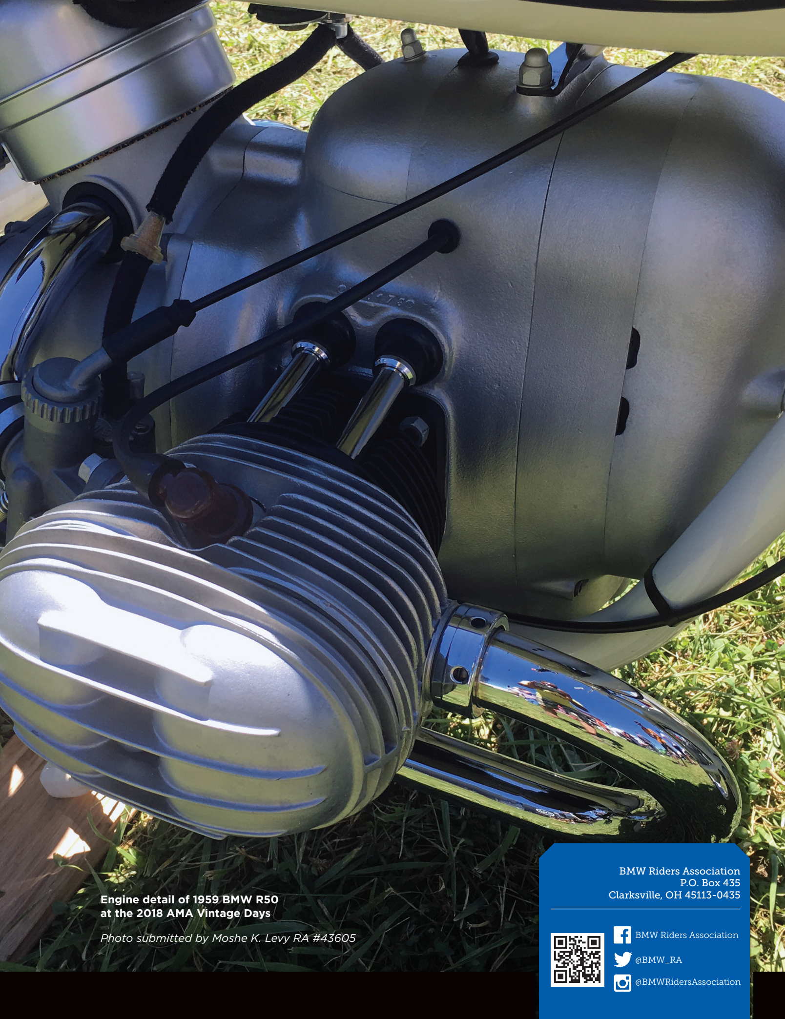
Engine detail of 1959 BMW R50 at the 2018 AMA Vintage Days